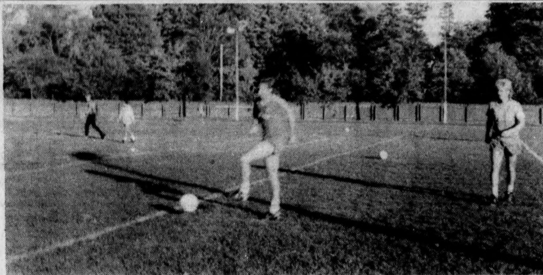
UNB Practice for CIAU's