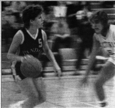
The Pandas split four games in Toronto last weekend. They defeated Ryerson and York but lost a couple to Toronto and McMaster. They start their conference schedule at the U of S this weekend.

THINGS AREN'T SO BAD HERE especially when you look at the crowd of the UBC-Brisbane game last weekend when your humble reporter was down in Lotusland last weekend. About 100 fans were there to see top-notch hoop action. Maybe they are too close to the Seattle SuperSonics, who might just bank their way to the top in the NBA this season. Maybe they just don't like basketball as there were 2700 boisterous fans to see the Bears and the Birds tangle in the western final in football. One wonders.