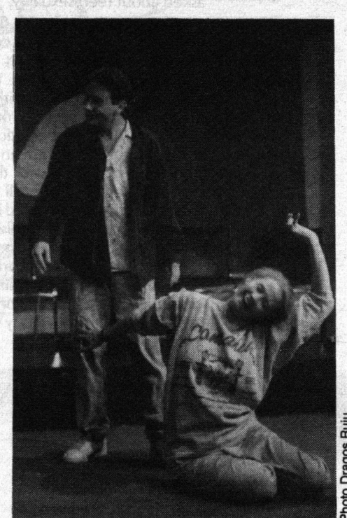
Theatresports actors laugh it up

If you've never seen Theatresports you have to check it out. I guarantee that it's humanly impossible to sit through the evening without laughing. It's on every Sunday night at eight at Theatre Network.