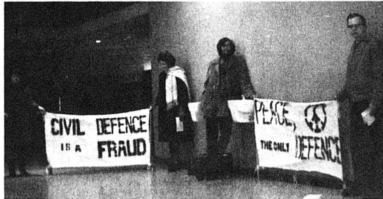
DEMONSTRATIONS MORE AND MORE —Members of the Combined Universities Campaign for Nuclear Disarmament picketed the recent Alberta Civil Defence meeting in the Jubilee Auditorium.