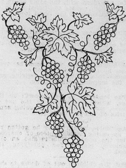
PATTERN P. Shirtwaist Front.

This cut is a small reproduction of an embroidery pattern 10 x 15 inches. On receipt of 15 cents we will send the large design by mail to any address. The pattern may be transferred to any material for embroidering by simply following the directions given below.