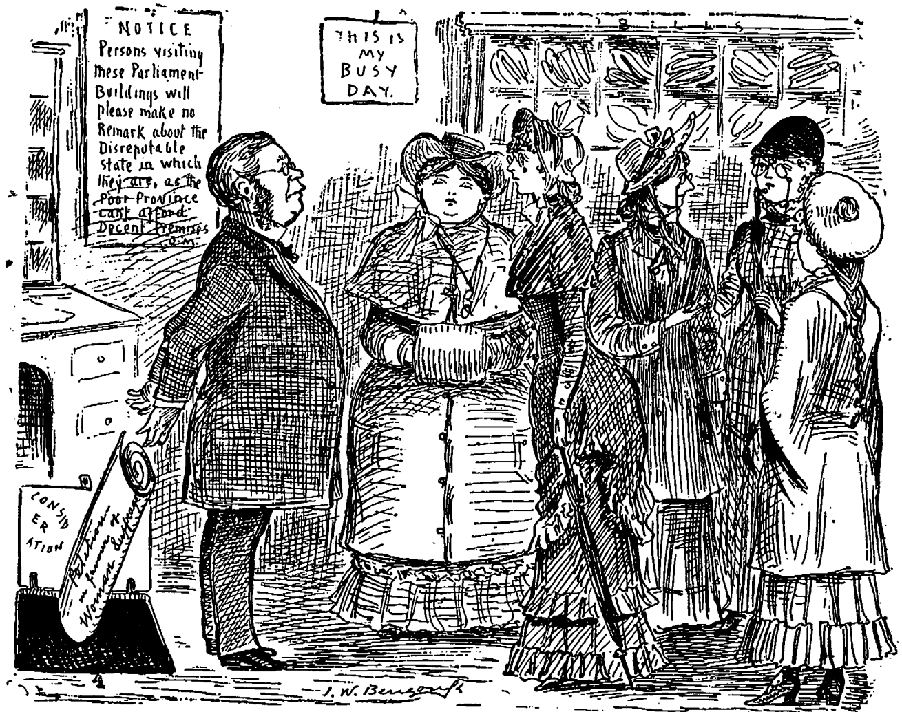
GRAND TRIUMPH FOR THE WOMAN SUFFRAGISTS. MR. MOWAT TAKES THEIR PETITION INTO HIS CONSIDERATION!!