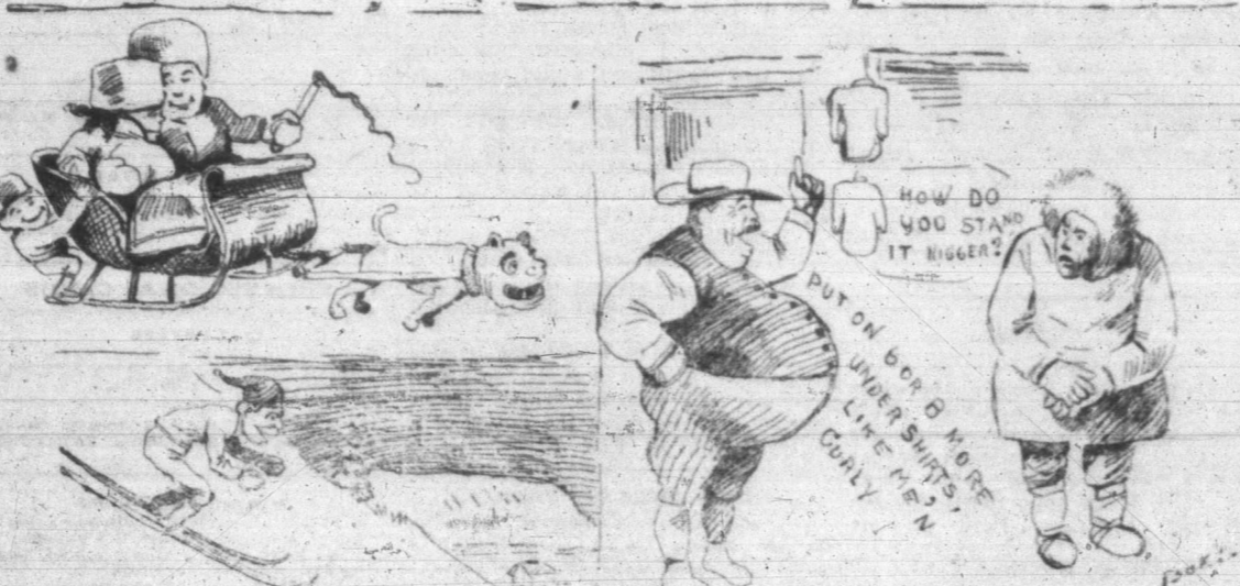
WHEN THE YUKON IS IN GRIM WINTER'S ICY GRIP.