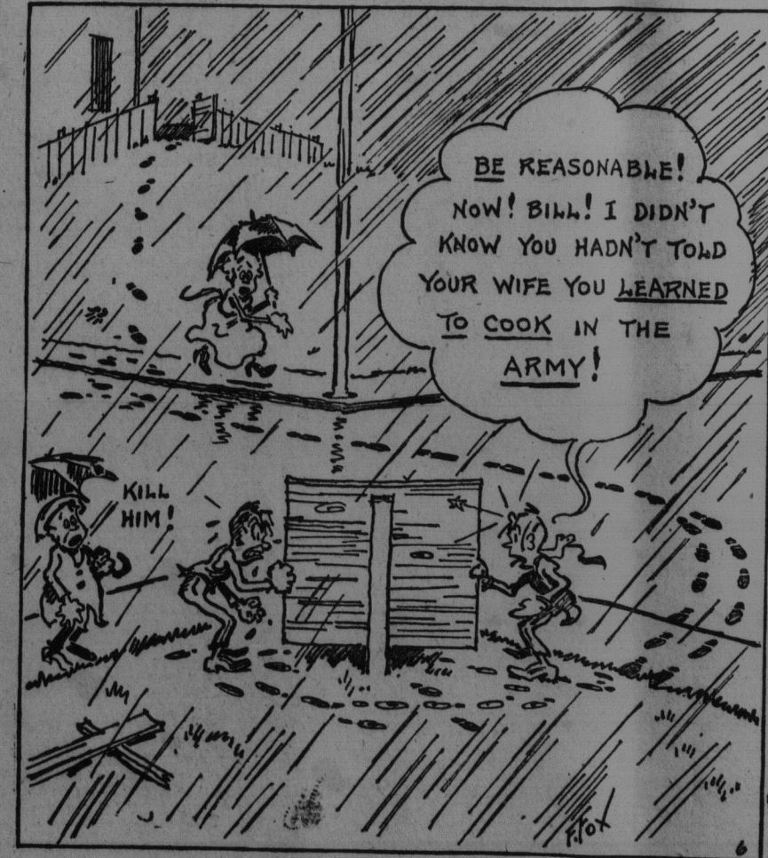
An attempt at justifiable homicide.