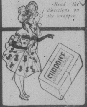
Read the directions on the wrapper.

And yet it costs no more than ordinary soaps.