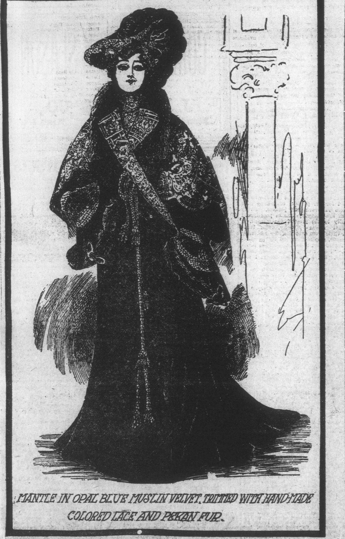
MANTLE IN OPAL BLUE MUSLIN VELVET, TRIMMED WITH HAND-MADE COLORED LACE AND PERSIAN FUR.