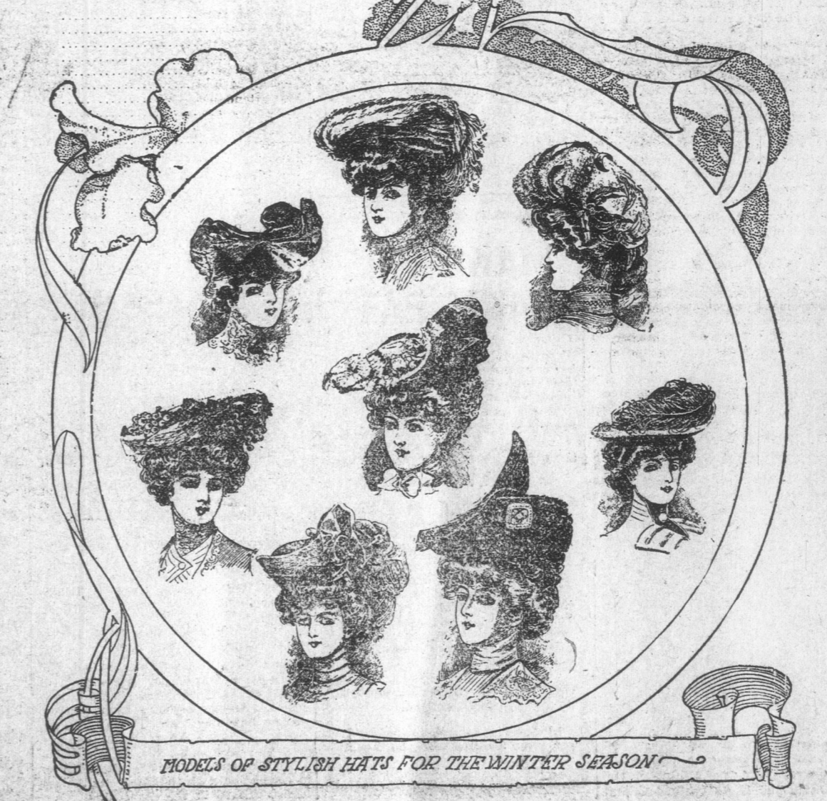
MODELS OF STYLISH HATS FOR THE WINTER SEASON

The roughly turned ball is kept in this position about a year. Then comes the polishing, whitening, etc. A good deal of hard rubbing is also necessary, as the ball, before being used, should be as near perfect as possible.