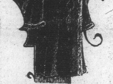
THREE-QUARTER VELVET MANTLE TRIMMED WITH CHAMOISIA AND PASTEL CHAMOISIA AND PASTEL MENTHIERE

BABY HUMORS—Dr. Agnew's Ointment soothes, quiets, and effects quick and effective cures in all skin eruptions common to baby during teething time.