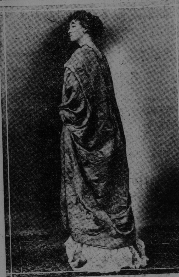
SUMPTUOUS EVENING WRAP OF VELVET BROCADE. The opera vestibules and the foyer of the New Theatre, taken up countless by the fashionables, have been a revelation this year in superb evening wraps. The straight, simple military cape of last season has been superseded by magnificent draped garments made of the richest fabrics produced by the weaver's loom.