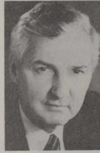
Paul Desmarais Chairman and Chief Executive Officer, Power Corporation of Canada