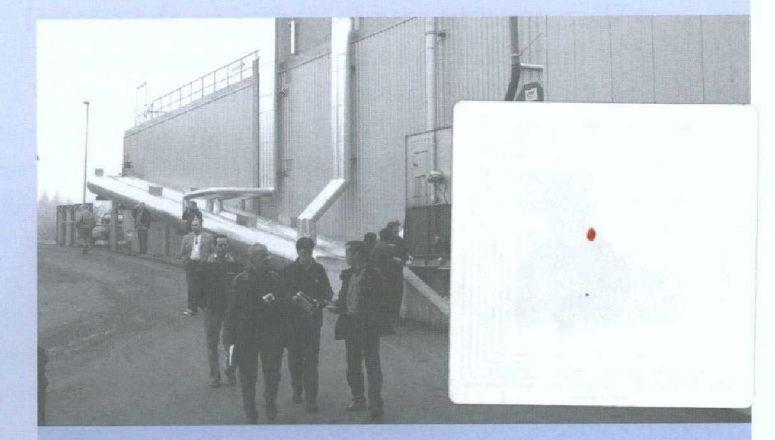
The Canadian delegation visited biogas plants in southern Germany and Austria.

In fact, this is one of the most effective methods of converting biomass to energy. The methane in biogas can be used to either fuel electrical generators or, with suitable