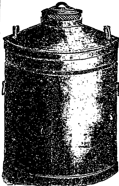
"EMPIRE STATE" MILK CAN.