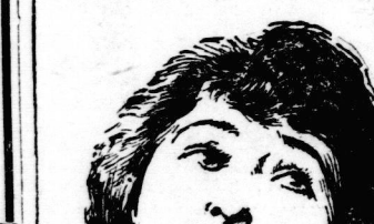
Elsie Ferguson in "Sacred and Profane Love" A Paramount Picture

Mr. Keaton had been playing with Roscoe Arbuckle in his horseplay pro- ductions for three seasons, when he