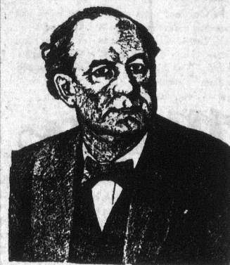
WILLIAM JENNINGS BRYAN.

Here the home-coming Nebraskan fairly was mobbed by the thousands who had forced their way into the corridors. Finally an entrance was effected by the police and Bryan reached