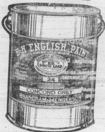
T. P. CALKIN & CO. Kentville, N. S.