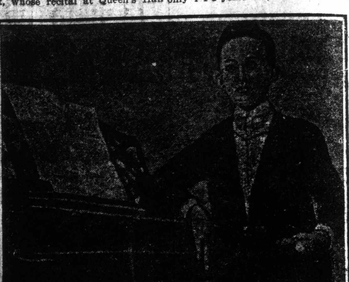
LATEST MUSICAL PRODICT-THE BOY PLAN!

on Monday was a revelation of musical who is with him in London, "and then genius—was practicing for his next for some years practiced two hours concert on Monday. tent of the practice work to which he ther a lawyer, died when he was only has accustomed himself daily. 1 year old. At the age of 5 he secured