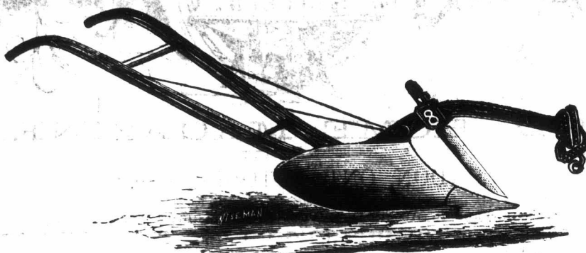
No. 8 Plow.

The above cut represents our No. 8 Plows, which are in such good demand among Farmers at the present time. Made of the very best qualities of Iron and Steel, and with choice Elm Bent Handles. They are acknowledged by all who have used them to be equal to any SOLID IRON PLOW, and at half the cost. Pamphlets and Price Lists sent on application.