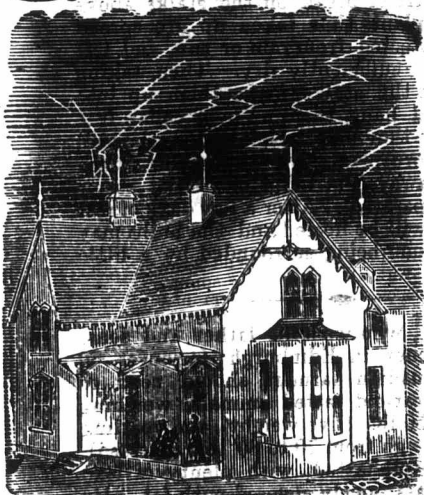
This shows a dwelling properly protected.

Incorporated 1878. Capital Stock $50,000. GLOBE