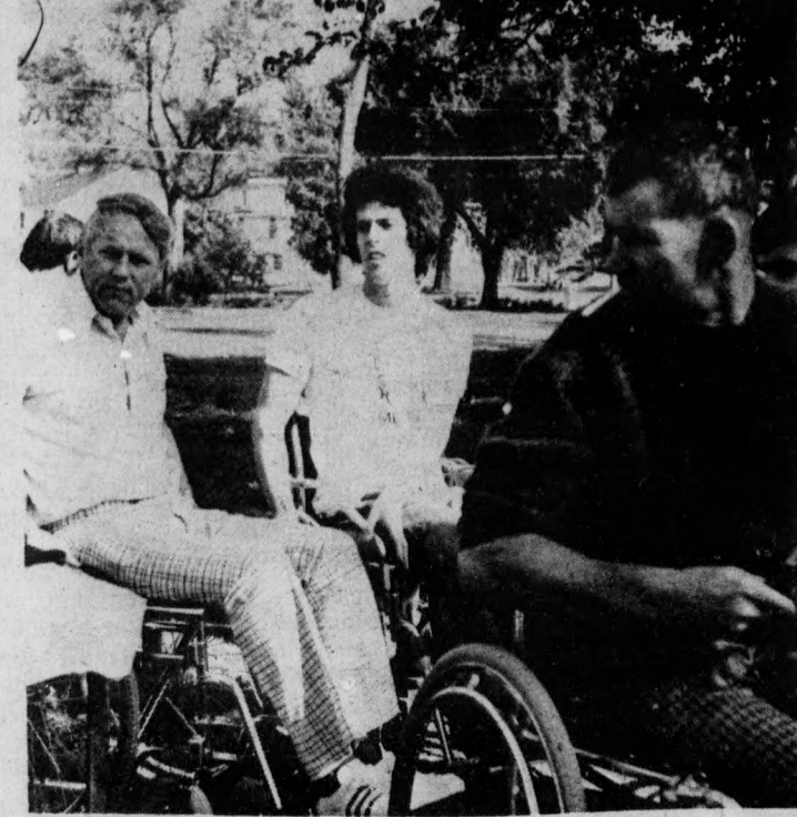
Some of the participants from the Wheel-a-thon start off to wheel a total of