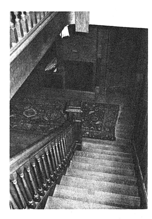
A FINE OLD HOUSE ... gone to pot?

People in the Saskatchewan Drive house are trying to live a philosophy of