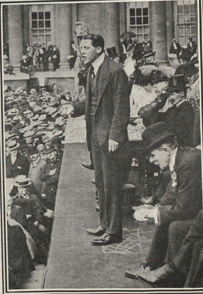
Mr. F. E. Smith, K.C., M.P., as he appeared a few days ago at a Unionist Demonstration at Blenheim Castle. Since then he has sailed for Canada to study the attitude of the Dominion on Imperial Naval Defence. "F. E.," like his bosom friend, Winston Churchill, is one of the great Young Men of England.