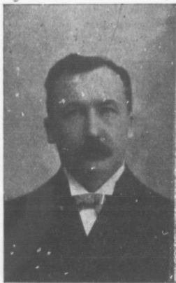
HON. CLIFFORD SIFTON The successful leader in the West.