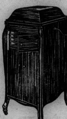
Victor-Victrola No. 11, 8 Mahogany or oak

During the past few weeks the managing committee of the Public Reading Room have been approached by several men who asked that one of the two rooms engaged for this purpose be set aside for those desiring to smoke a quiet pipe while enjoying the reading of the literature supplied. As there are quite a number of men out of work at present with nowhere else to put in their time, the committee have accordingly placed the small room at their disposal.