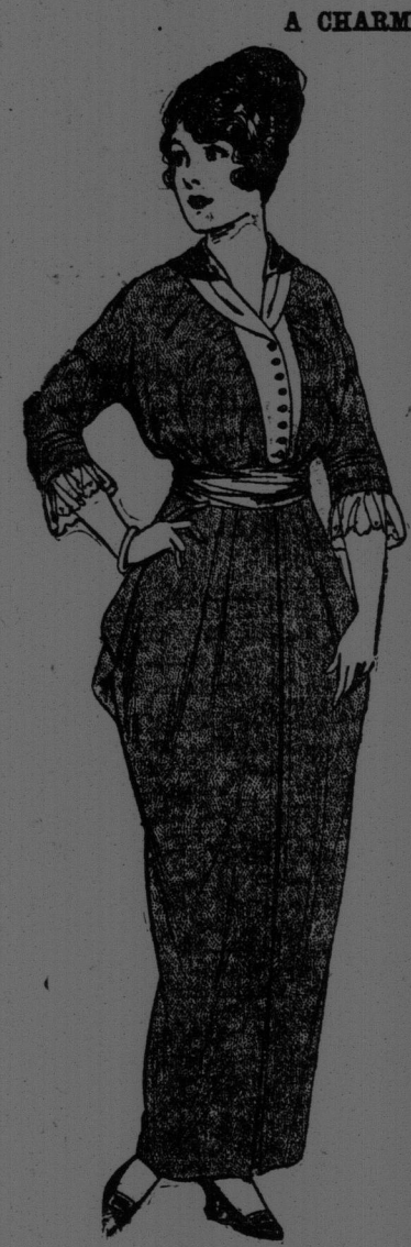
A CHARMING FROCK.

summer, combined with rich blue satin for the belt and outer collar. To make the dress requires 6 yards of 36-inch material and 1 yard of 38-inch satin. Lace or plaited batiste may be used for the sleeves.