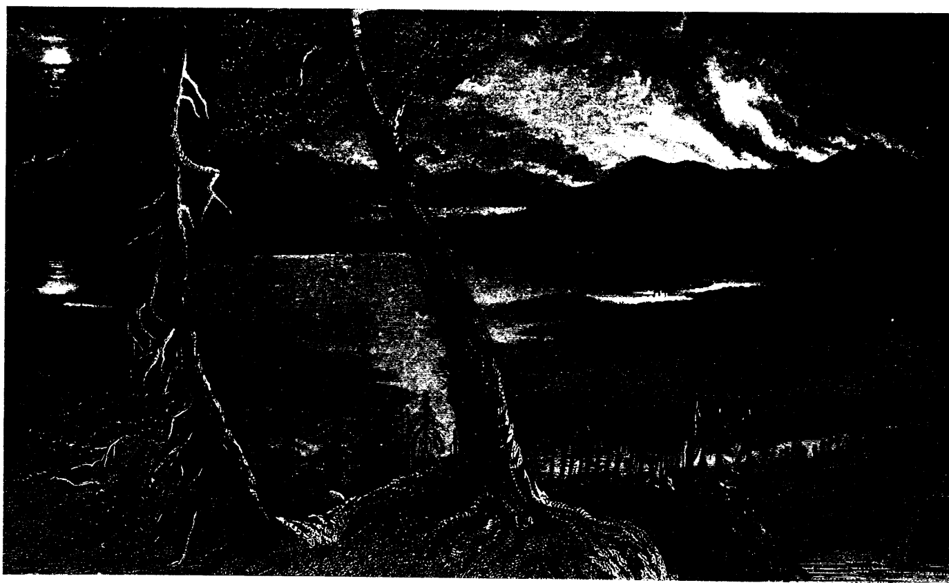
LAC DES ALLUMETTES.