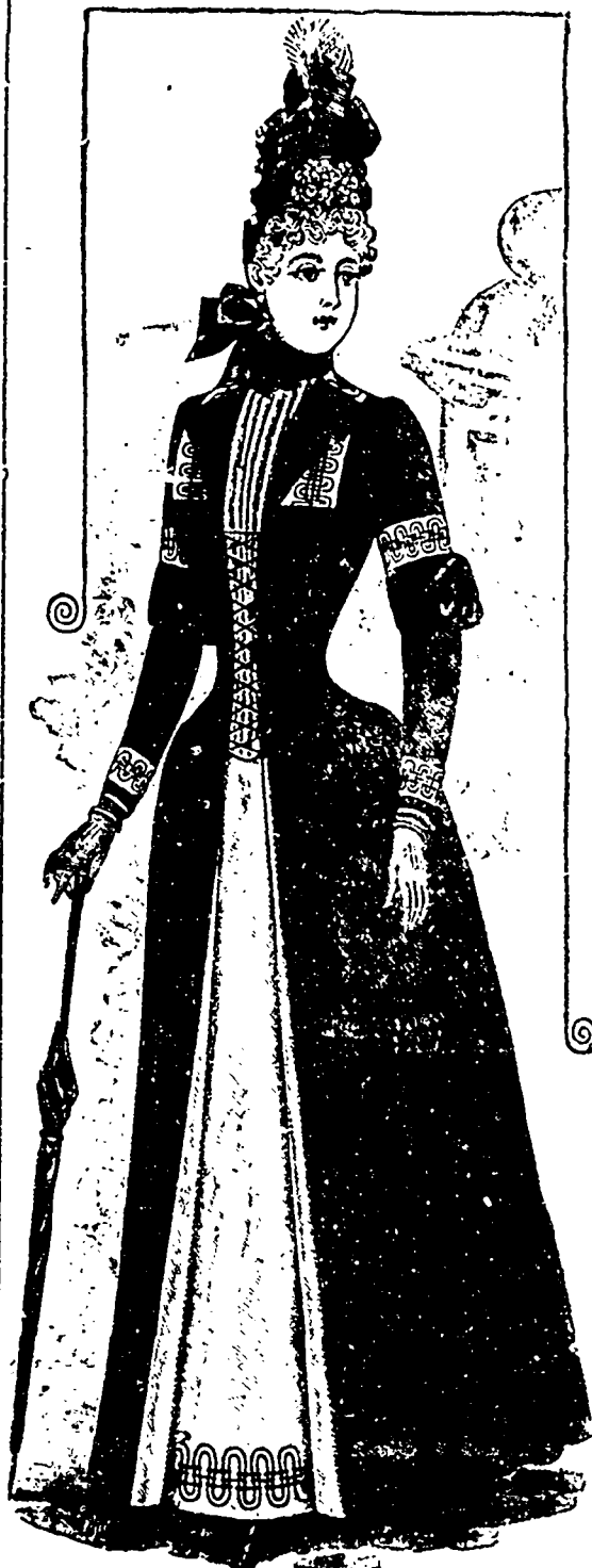
4257 Ladies' Polonaise, 30 to 44 inches bust measure. Price, 30 cents.

N. Y. Domestic Perfect Fitting Paper Patterns.