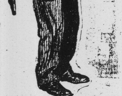
Bannister.

"This was not all. I have a new writing table with a fine surface of red leather. I am prepared to swear, and so is Bannister, that it was smooth and unstained. Now I found a clean cut in it about three inches long—not a mere scratch, but a positive cut. Not only this, but on the table I found a small ball of black dough or clay, with specks of something which looks like sawdust in it. I am convinced that these marks were left by the man who rifled the papers. There were no foot-