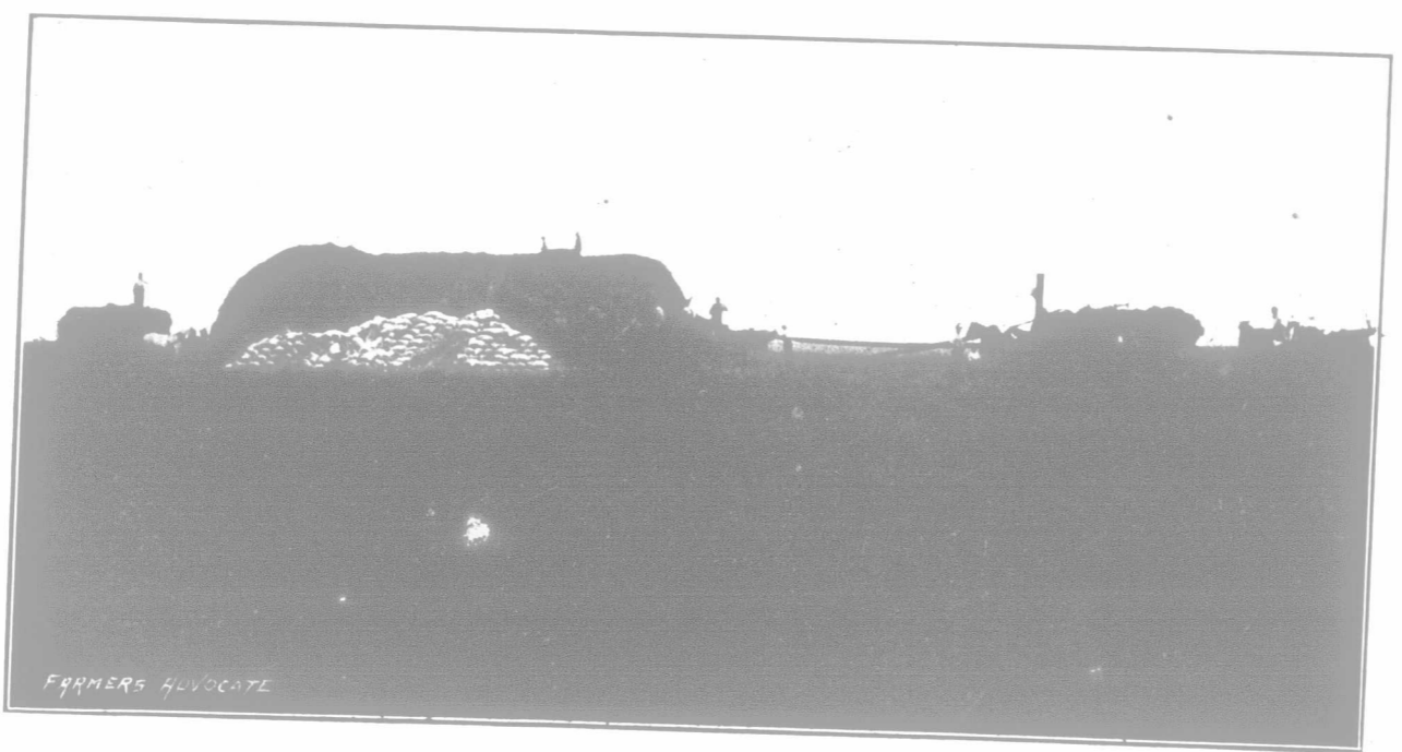
Threshing Oats at Matsqui—First Crop.

Matsqui is 30 miles from New Westminster, 43 miles from Vancouver, 28 miles from Whatcom.