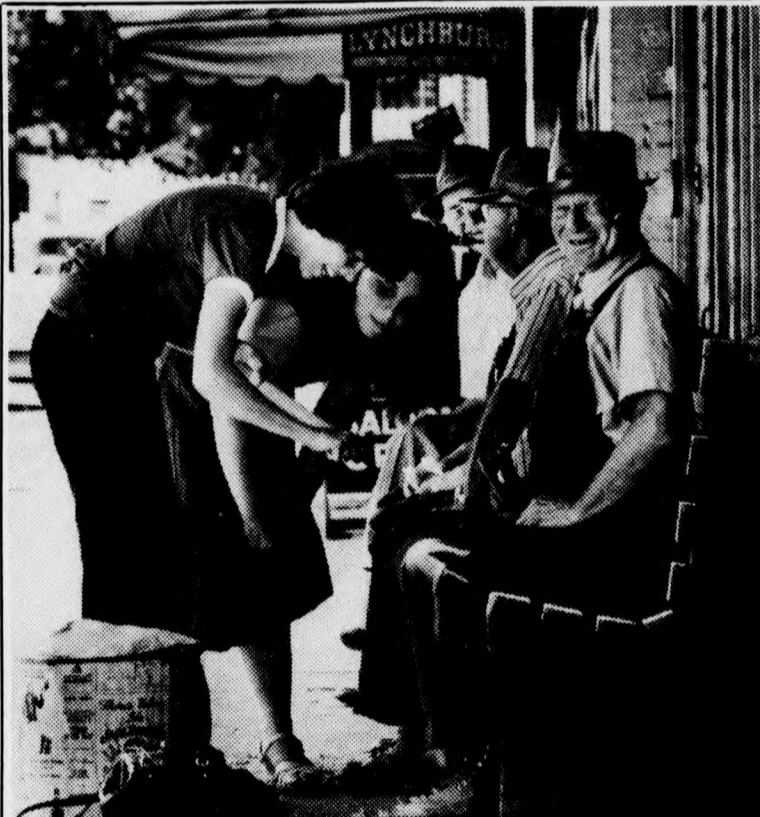
Jack Daniel's Tennessee Whiskey is represented in Canada by FBM Distillery Ltd., Brampton, Ontario

Reservations Recommended Discount on large orders