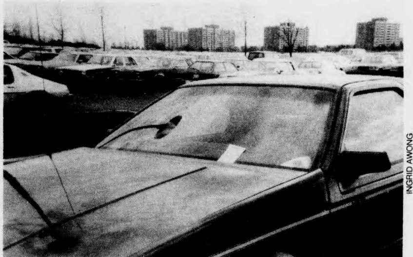
BOOK 'EM, DANO: Is the above no more than windshield decoration?