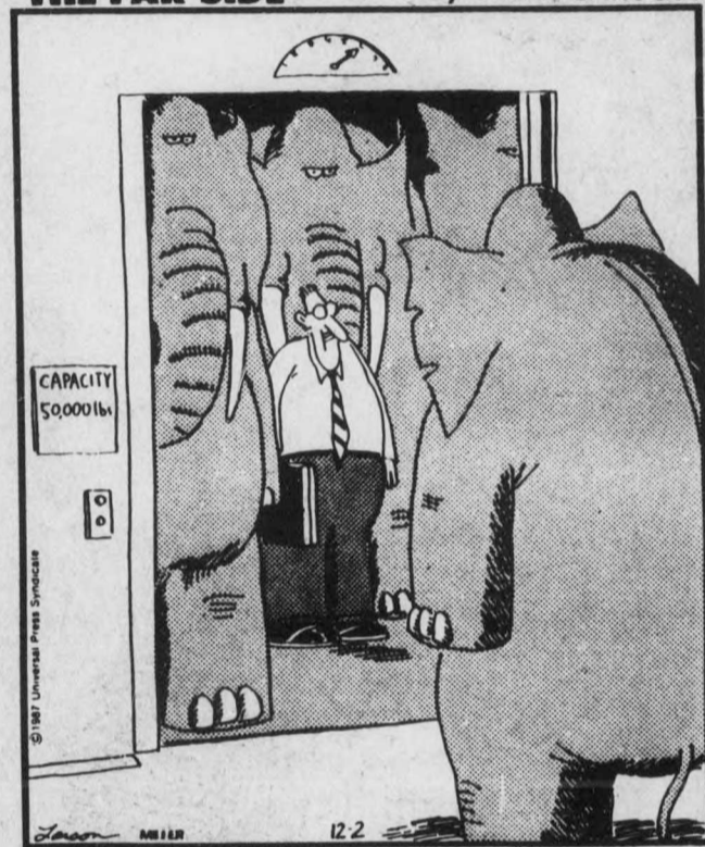
To Ernie's horror, and the ultimate disaster of all, one more elephant tried to squeeze on.