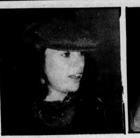
I'd give it to Ethiopia.