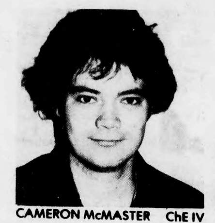
"We're close to the bars."