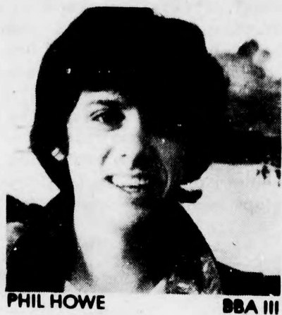
"I don't know; I'm always in