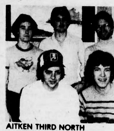
"Good, but we need a special bus to the liquor store.