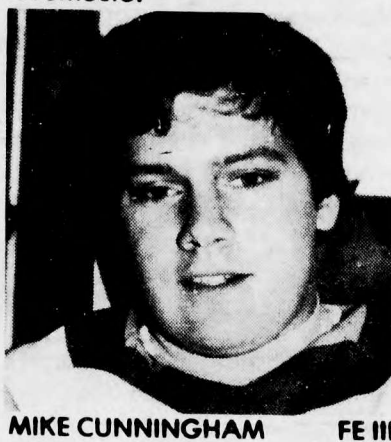
"Too far to walk"