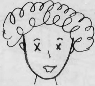
B.A. 2 Jill Williams

Alcohol shouldn't play such a prominent part because there are enough activities to supply a sufficient amount of social interaction.