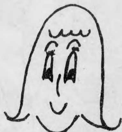
B.A. 1 Laurie Anstey

A pub every night is a good thing. They should allow drinking at the daytime events too. Everyone should have a good time.