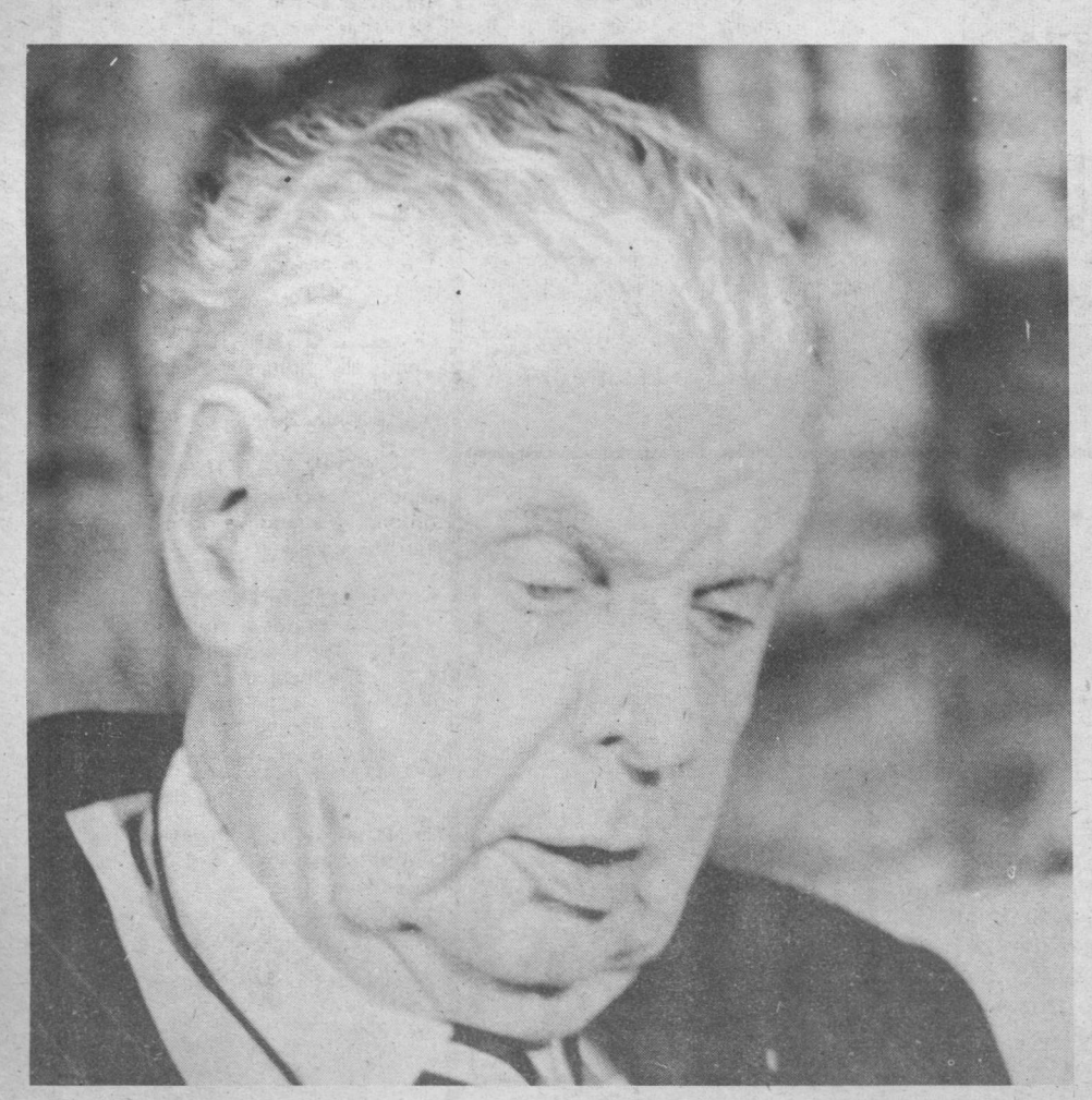
. during press conference

"There is an open season on inflation," he said. "There should be an increase in penalties for those guilty under the Combines Investigation Act." He likened the penalties now to that of a theif who steals a million dollars and is fined only five hundred thousand. He is still making a profit and will do it again.