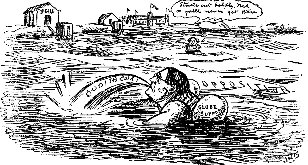
MR. BLAKE AT THE (POLITICAL) SEASIDE.

P. BURNS Great Reduction in Prices. Direct from Cars, FOR ONE WEEK. WOOD Best BEECH and MAPLE, Dry, Delivered to any part of the City. Orders left at Offices: Cor. Bathurst and Front 51 King St. E., 109 St. George St. West and 592 Queen St. West P. BURNS