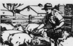
You can't afford to do this

Why not put a stop to this needless waste with a De Laval Cream Separator?