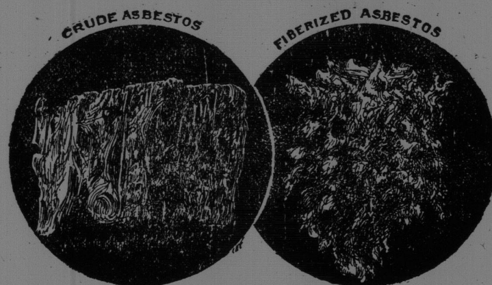
ASBESTOS AS IT APPEARS IN THE MINE. FIBERIZED ASBESTOS, WORTH FROM $400 TO $600 PER TON.

While all Minerals, such as Copper, Lead, Zinc and other metals, have declined frightfully during the late panic, ASBESTOS has advanced in price some 25 per cent. 85 PER CENT OF THE WORLD'S SUPPLY OF ASBESTOS IS FOUND IN QUEBEC.