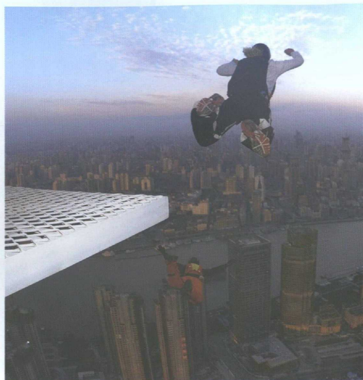
Be prepared before you leap into China, says one trade expert.