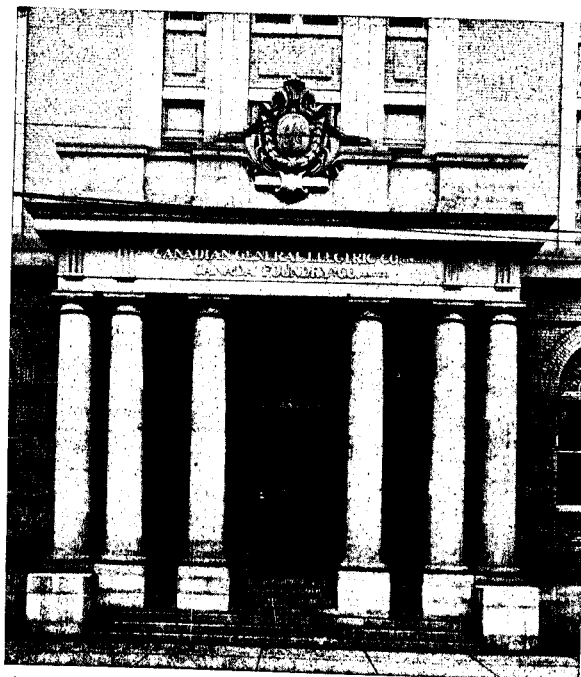
Main Entrance, Canadian General Electric Co.'s Building, Toronto Darling & Pearson, Architects. FRED HOLMES & SONS, Contractors.