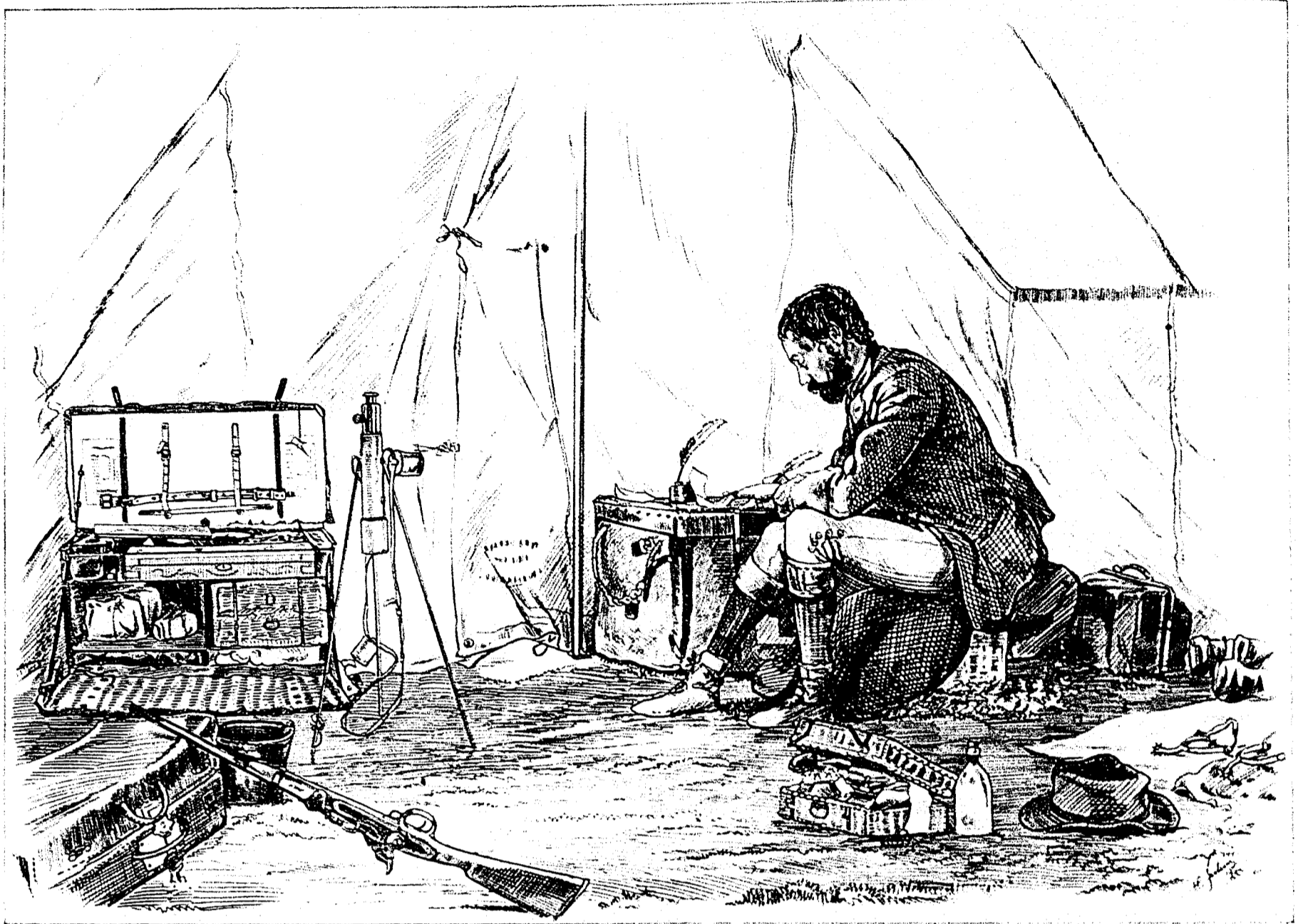
THE DOCTOR IN HIS TENT.