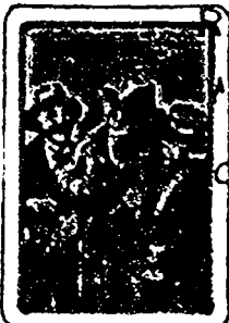
"The Soronado" in the SALON SERIES— retailing at 48

The UNION CARD & PAPER CO., Limited MONTREAL.