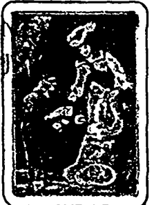
"Fortune Telling" in the SALON SERIES— retailing at 50c.

RETURNED AUG. 8 1904 THESE LINES PAY A HANDSOME PROFIT TO THE RETAILER.