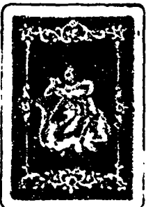
"Little Pot" in the SALON SERIES retailing at 48

SUPPLIED ONLY THROUGH THE JOBBER TRADE. ORDER FROM YOUR WHOLESALE.