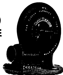
Steel Pressure Blower for blowing Cupola and Forge Fires