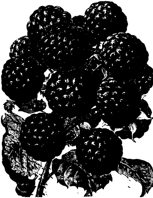
FIG. 32.—THE LOVETT.

The other is a black raspberry, said to be as large as the Gregg, earlier, more productive and much hardier. If it should bear out these claims it will be an ideal berry indeed. This raspberry is also a chance seedling, originating in Indiana, where it has been fruited for some years by the side of Doolittle Improved, and Gregg, and has been found to ripen as early as the former, to be as large as latter, very firm, sweet, and of finest flavor. We shall take the earliest opportunity of testing the real worth of these two novelties. It seems almost a misfortune that the names should be so similar as Lovett's Early Strawberry and The Lovett Raspberry.