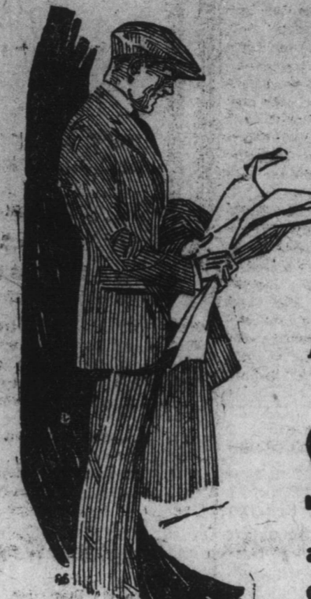
Figure in a Special and Generous