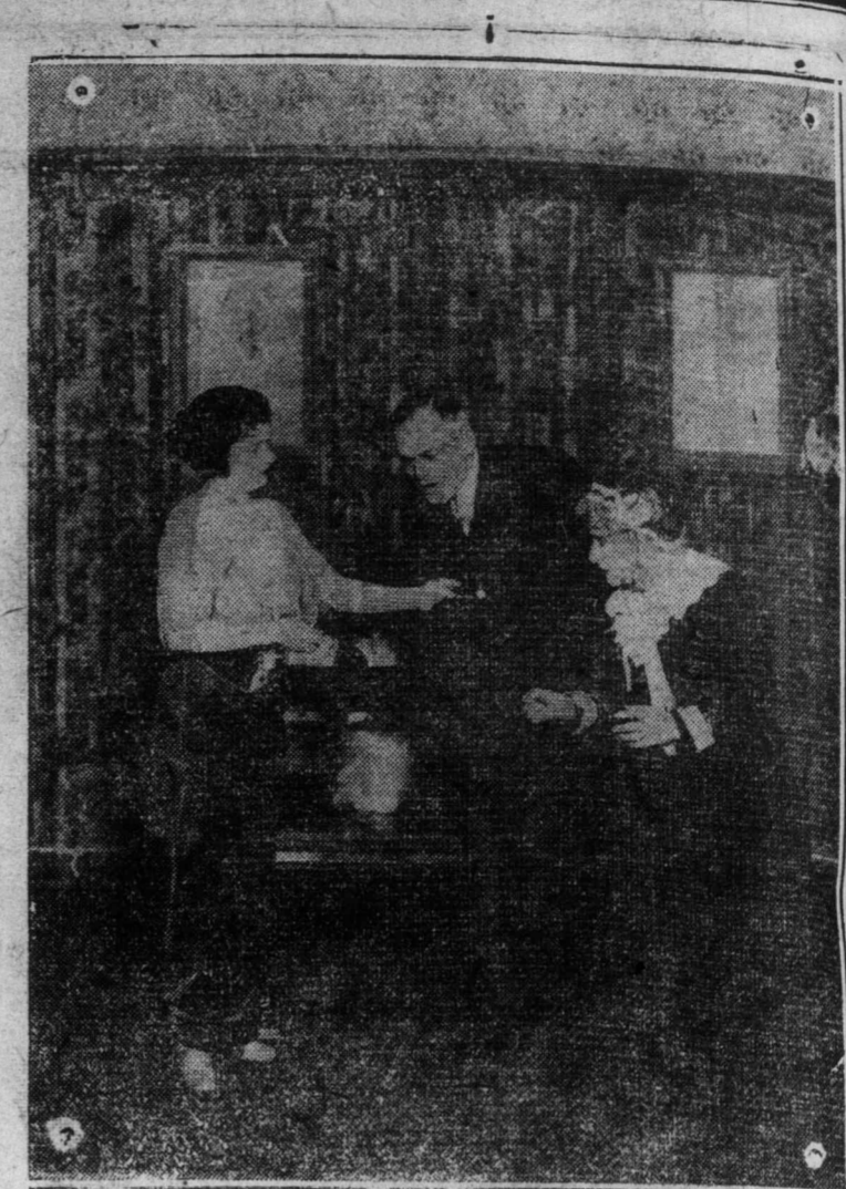
Scene from the play "The Revelations of a Wife," at the Grand Opera House Tuesday and Wednesday, with daily matinees each day

Kearns says Dempsey will soon come east. He hopes to be cleared of the charges that he was a war slacker and both he and his promoter believe that a few good exhibitions in the east and middle west will re-