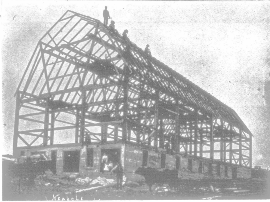
Barn of Archie Crozier, Beachburg, Ont. Size of wall, 45x120 ft. Wall, cistern and floor built with THOROLD CEMENT . The holes showing along the top of the wall are for ventilation.

Read what Archie Crozier says about THOROLD CEMENT : BEACHBURG, ONT., AUG. 14, 1900.