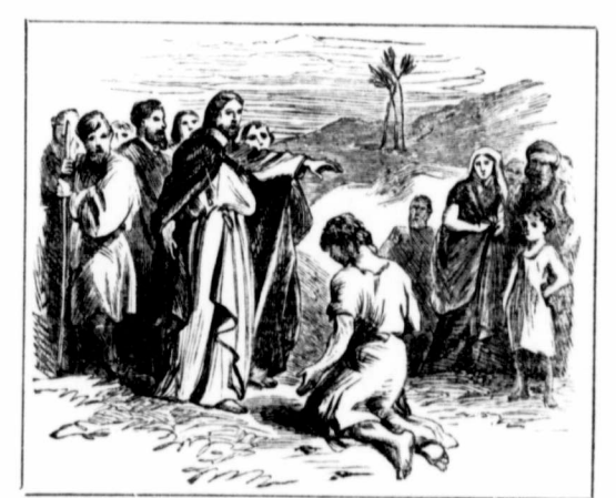
JESUS HEALING THE LEPER.

Dear children, remember that God is ready and willing to watch over and guard you during the voyage of life. Will you not put yourself in His keeping?