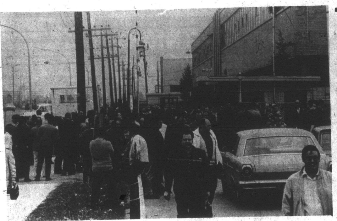
This was the scene last Wednesday at 12 noon when workers at Douglas Aircraft in Malton went on strike. Both the strike and negotiations between Douglas and union officials continue.